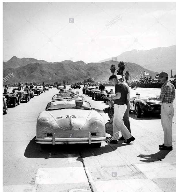
A Porsche Speedster with the front taped up. Palm Springs in the 1950s