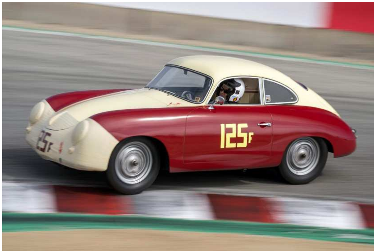
Uwe Biegner/1953 Porsche 356 turns into Turn 8 aka The Corkscrew, October 2022. With thanks to https://sportscardigest.com/2022-velocity-invitational/

Burgundy red and cream, cream taped front. Race No 125